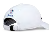
REAR OF CAP

*Choose Embroidery or Woven Label | Custom headwear lead time: 4 weeks from the date of artwork approval