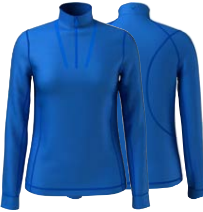
476 BLUE SEA STAR