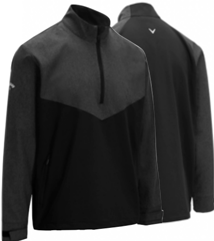
015 CAVIAR HEATHER