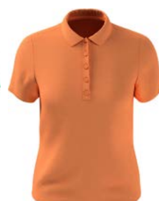
827 NECTARINE NEW