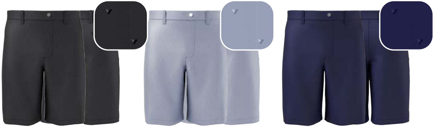
002 CAVIAR 460 INFINITY 410 PEACOCK