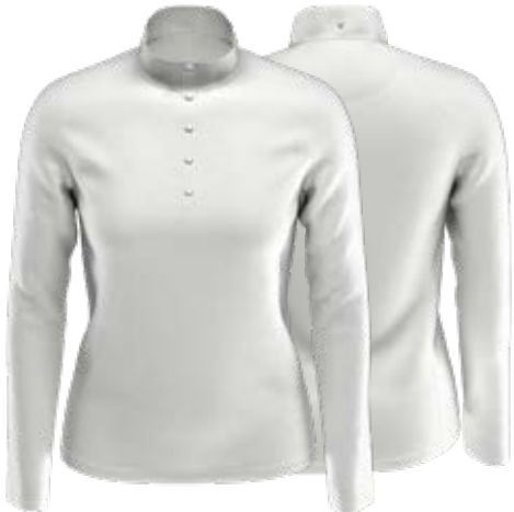
123 BRILLIANT WHITE