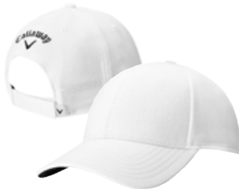
101 WHITE / BLACK