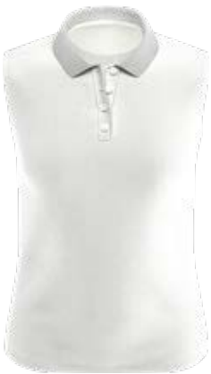
123 BRILLIANT WHITE