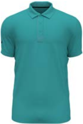
399 BALTIC NEW