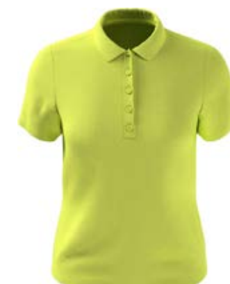
360 LIMEADE NEW