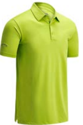
333 DAIQURI GREEN NEW