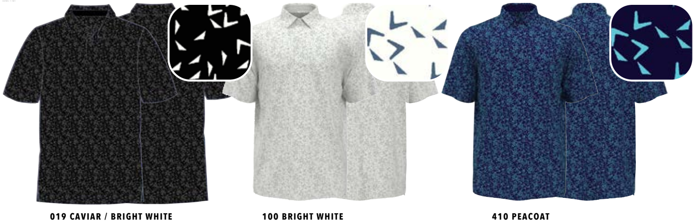
019 CAVIAR / BRIGHT WHITE