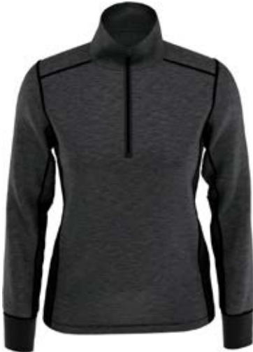
026 EBONY HEATHER