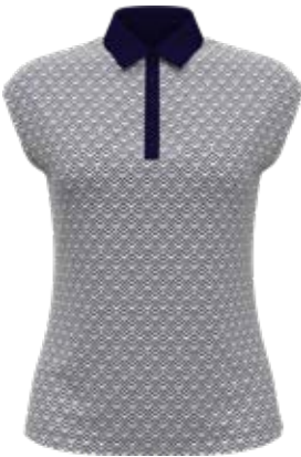
123 BRILLIANT WHITE