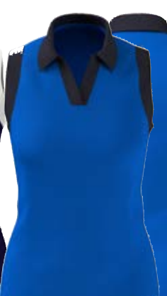
476 BLUE SEA STAR