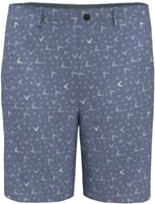
425 FADED DENIM