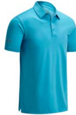
488 BLUE GROTTA NEW