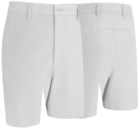
100 BRIGHT WHITE