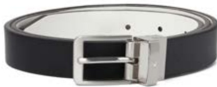
014 CAVIAR / WHITE