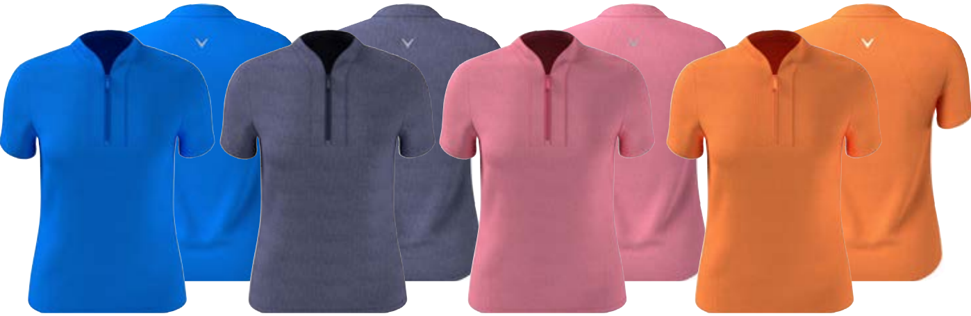
466 BLUE STAR