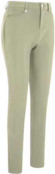
053 CHATEAU GREY