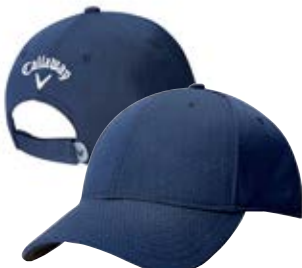
415 NAVY / BLACK