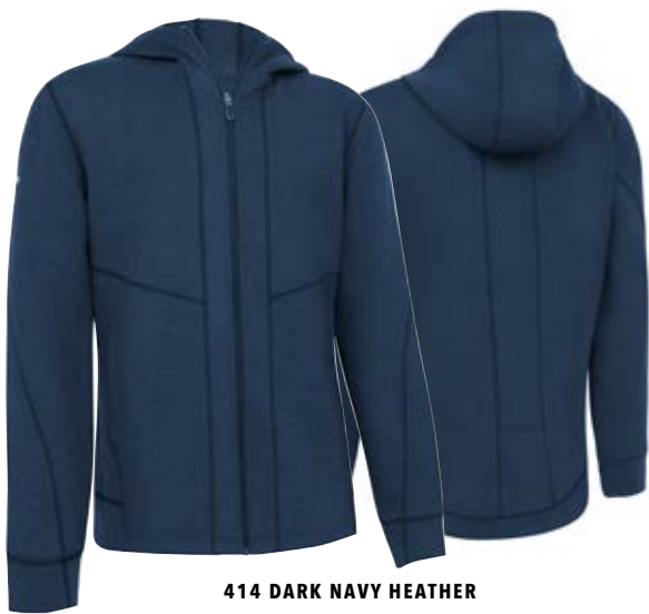
414 DARK NAVY HEATHER