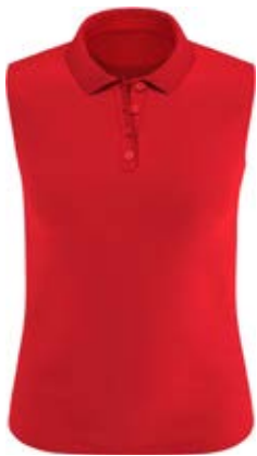
609 TRUE RED