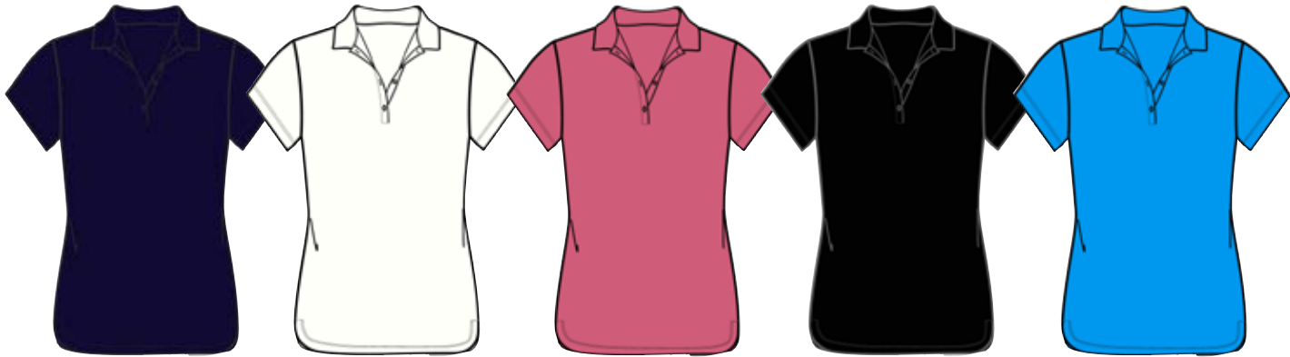
410 PEACOAT 100 BRIGHT WHITE 683 FRUIT DOVE NEW 002 CAVIAR NEW 983 SPRING BREAK NEW