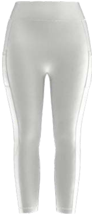
123 BRILLIANT WHITE