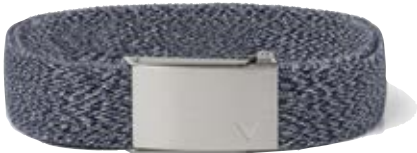
479 NAVY HEATHER