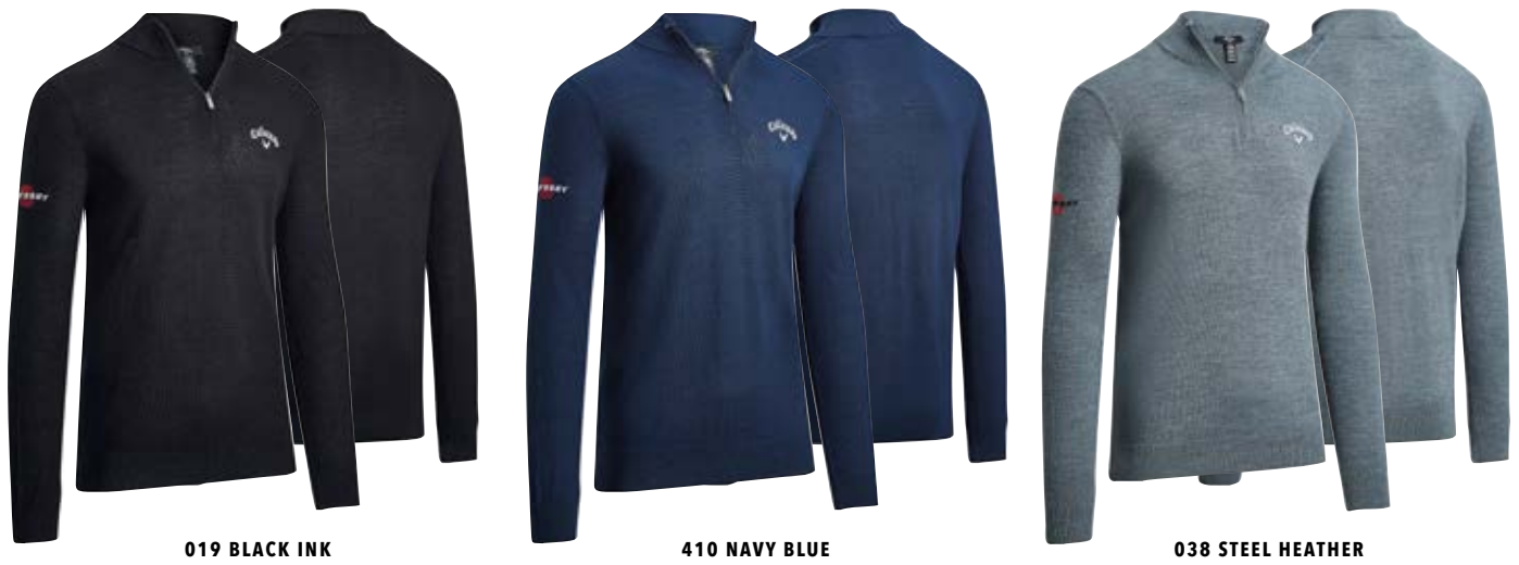
CGGF80M1 1/4 BLENDED MERINO SWEATER