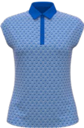
476 BLUE SEA STAR