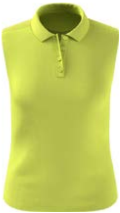
360 LIMEADE NEW