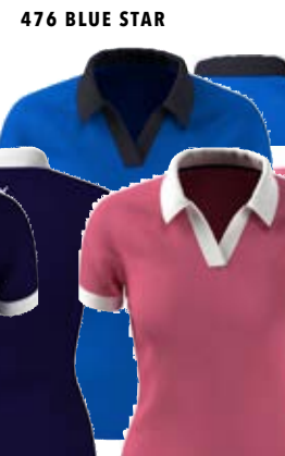
476 BLUE STAR