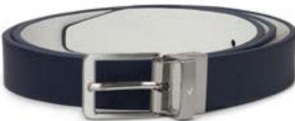
987 PEACOCK / WHITE