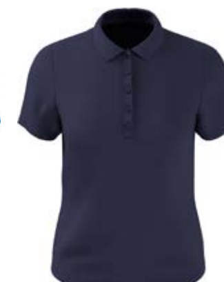
480 BLUE INDIGO NEW