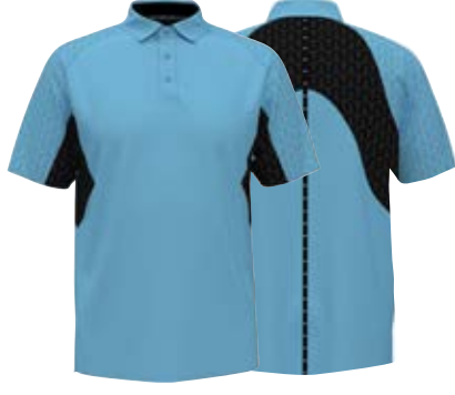
488 BLUE GROTTTO