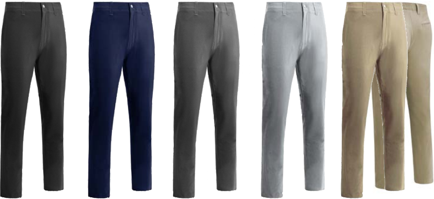
002 CAVIAR 401 NIGHT SKY 067 ASPHALT 037 QUARRY 256 CHINCHILLA