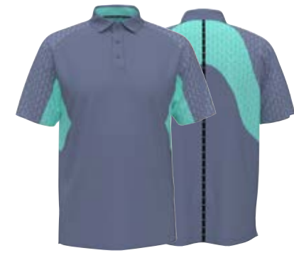
971 INFINITY / ARUBA BLUE