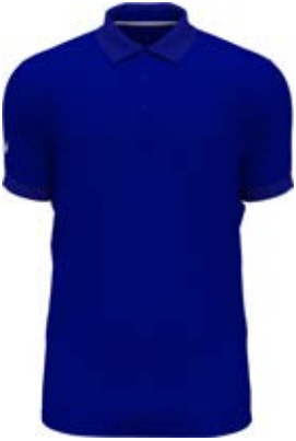
403 CLEMATIS BLUE NEW