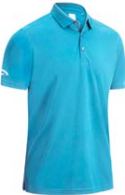
488 BLUE GROTTA NEW