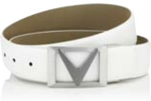
100 BRIGHT WHITE