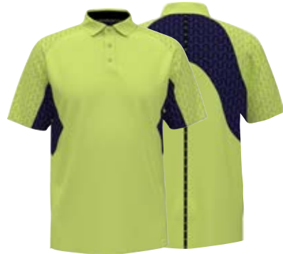
333 DAIQUIRI GREEN