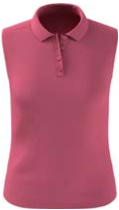
683 FRUIT DOVE NEW