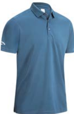
460 INFINITY BLUE NEW