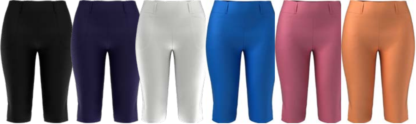
002 CAVIAR 410 PEACOCK 123 BRILLIANT WHITE 476 BLUE SEA STAR NEW 683 FRUIT DOVE NEW 827 NECTARINE NEW