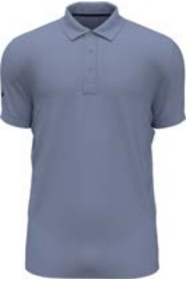
425 FADED DENIM NEW