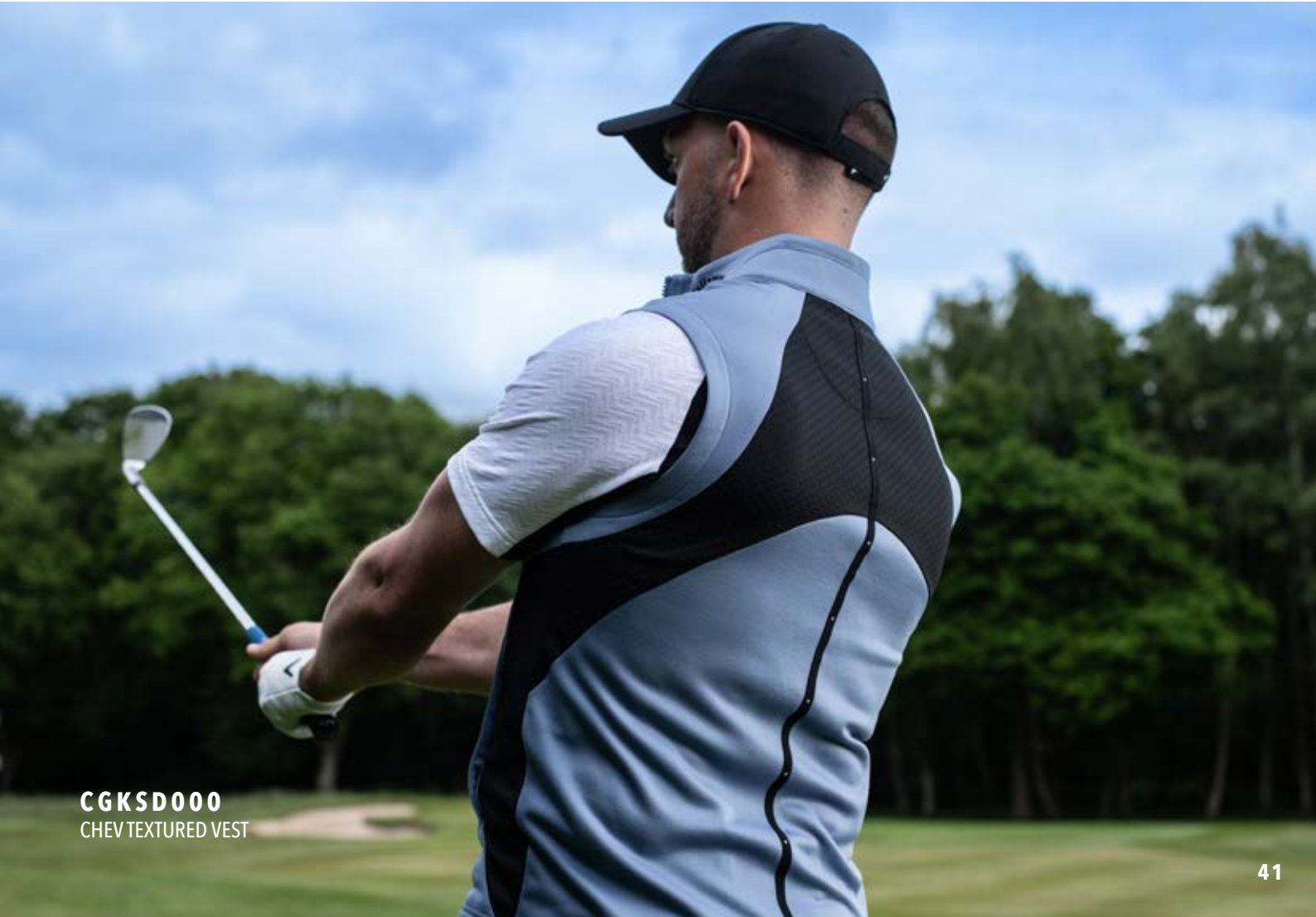
CGKSD000 CHEV TEXTURED VEST