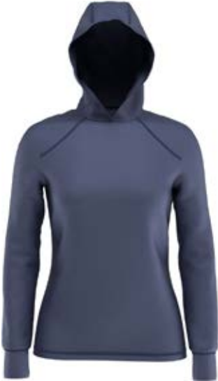
413 TRUE NAVY HEATHER