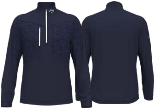
997 PEACOAT / BRIGHT WHITE