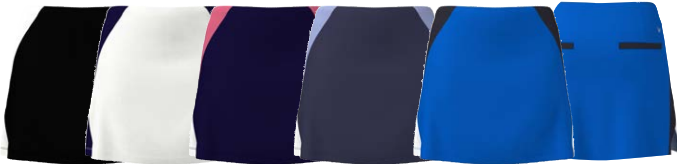
002 CAVIAR 123 BRILLIANT WHITE 410 PEACOCK 480 BLUE INDIGO 476 BLUE SEA STAR