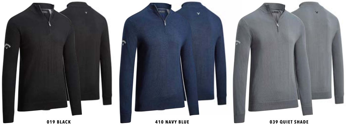
CGGF7079 WINDSTOPPER 1/4 ZIPPED SWEATER