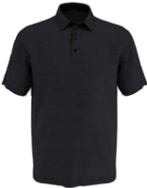
003 BLACK HEATHER

✓ SWING TECH™ ✓ STRETCH ✓ EASY-CARE ✓ COOLING