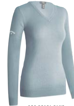
050 PEARL BLUE