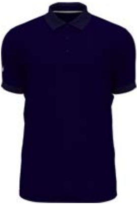
972 NAVY BLAZER