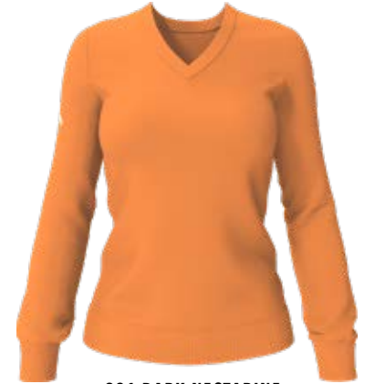
821 DARK NECTARINE