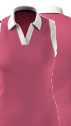
683 FRUIT DOVE