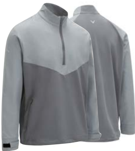
080 QUARRY HEATHER