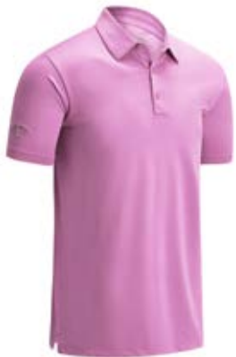
693 LILAC CHIFFON