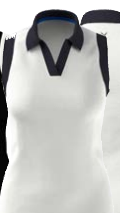
123 BRILLIANT WHITE