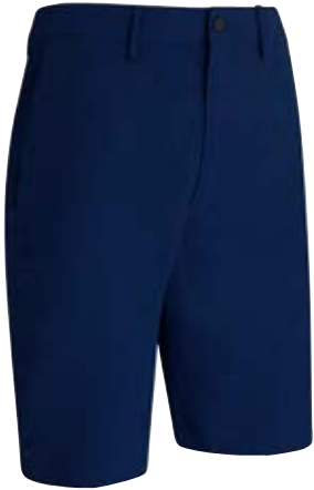
972 NAVY BLAZER