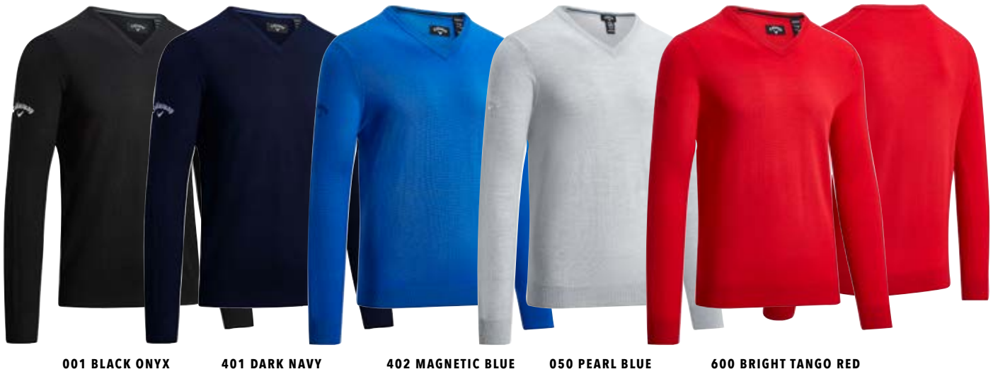
CGGS80Z2 V-NECK MERINO SWEATER