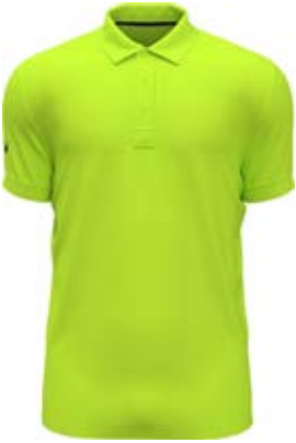
397 LIME PUNCH NEW