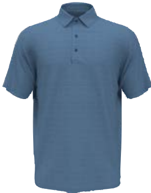
498 VALLARTA BLUE HEATHER NEW