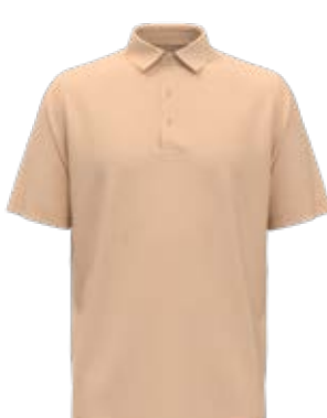
822 BIRD OF PARADISE HEATHER NEW