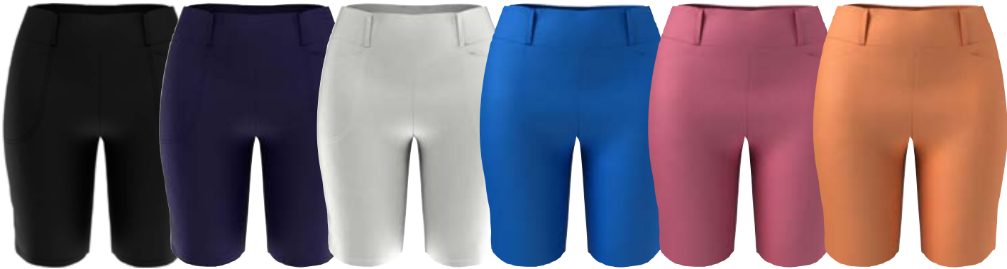
002 CAVIAR 410 PEACOCK 123 BRILLIANT WHITE 476 BLUE SEA STAR NEW 683 FRUIT DOVE NEW 827 NECTARINE NEW