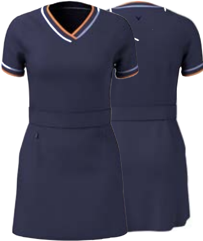
480 BLUE INDIGO