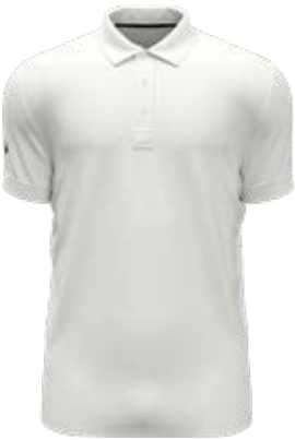
100 BRIGHT WHITE