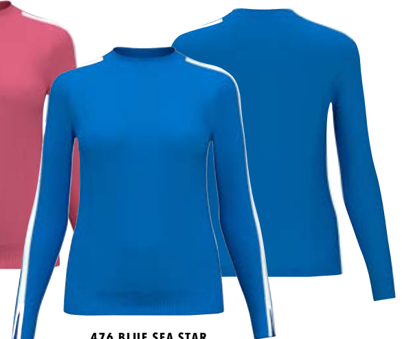
476 BLUE SEA STAR