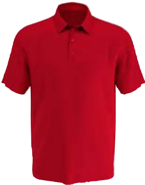
645 TRUE RED HEATHER