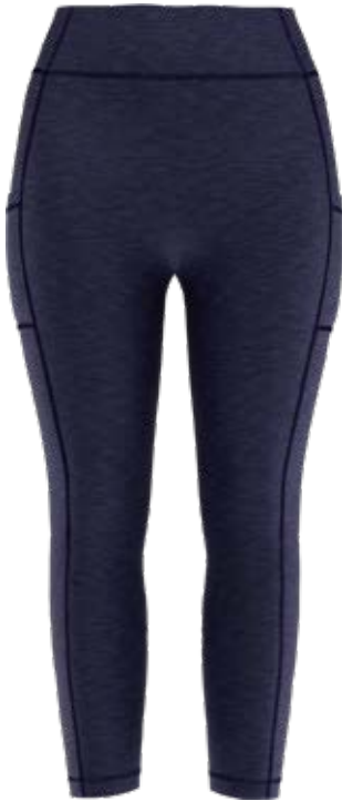
413 TRUE NAVY HEATHER