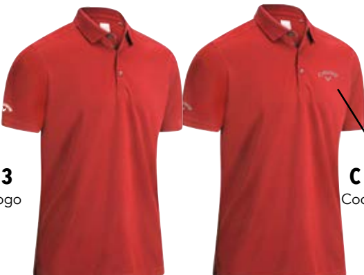
609 TRUE RED

CGKFBOW3 Code for added logo on left chest.