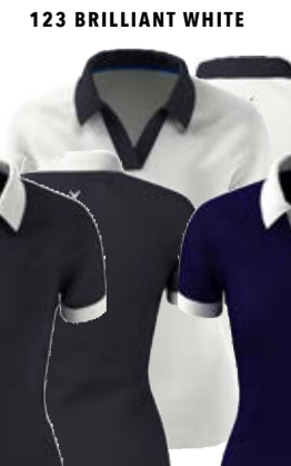
123 BRILLIANT WHITE