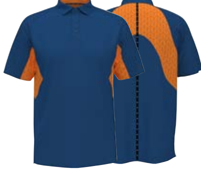
976 VALLARTA BLUE/ BIRDS OF PARADISE