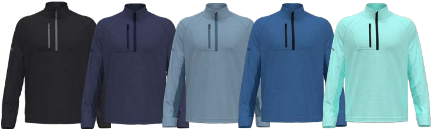
003 BLACK HEATHER