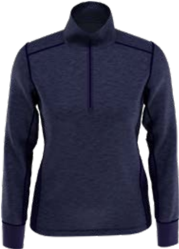
413 TRUE NAVY HEATHER