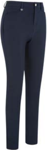
003 BLACK HEATHER