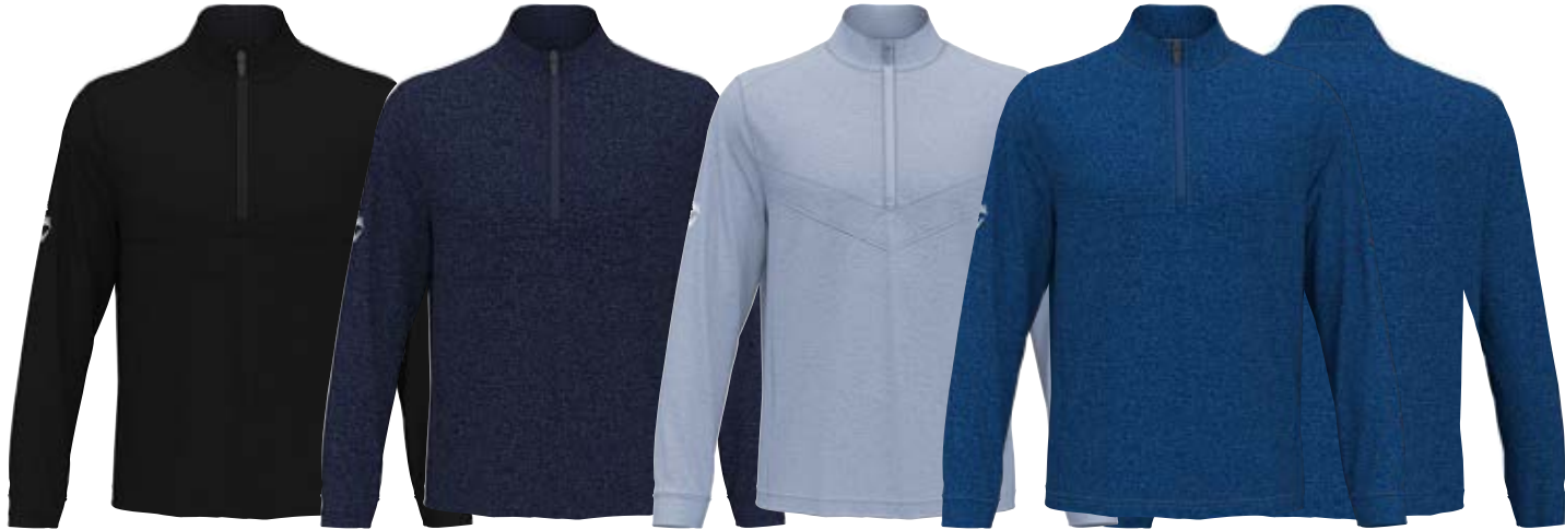
002 CAVIAR NEW