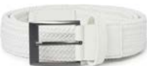
114 BRIGHT WHITE