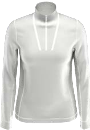
123 BRILLIANT WHITE