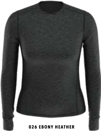
026 EBONY HEATHER