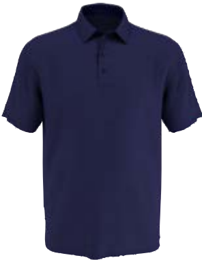
484 PEACOCK HEATHER