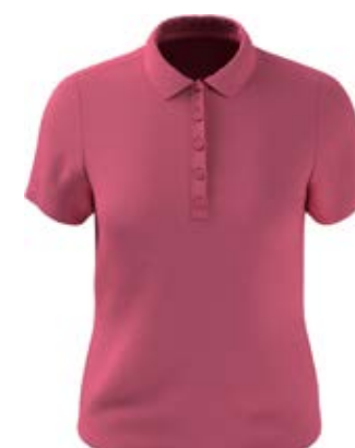
683 FRUIT DOVE NEW