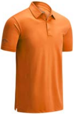
820 BIRD OF PARADISE NEW