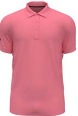
699 GERANIUM PINK NEW