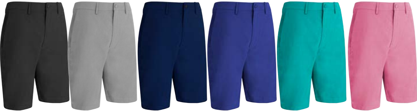
002 CAVIAR 037 QUARRY 972 NAVY BLAZER 403 CLEMATIS BLUE 399 BALTIC 699 GERANIUM PINK