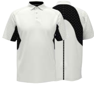
100 BRIGHT WHITE