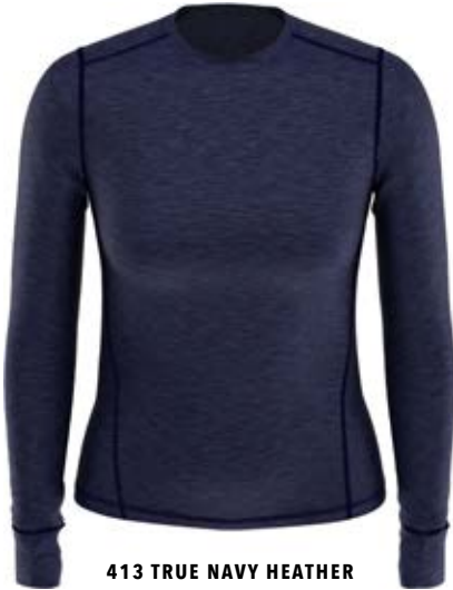
413 TRUE NAVY HEATHER