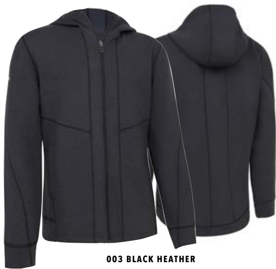
003 BLACK HEATHER