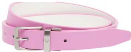
665 PINK SUNSET/WHITE