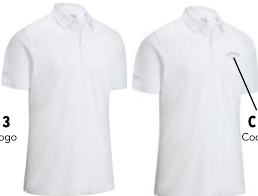
100 BRIGHT WHITE

CGKFBOW3 Code for added logo on left chest.