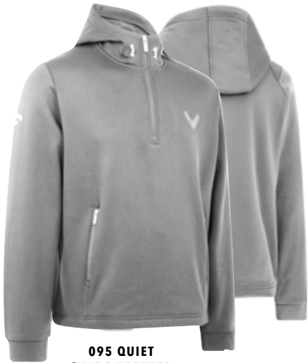
095 QUIET SHADE HEATHER