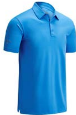
983 SPRING BREAK