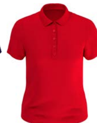
609 TRUE RED