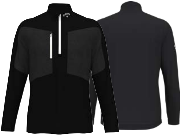
019 CAVIAR / BRIGHT WHITE