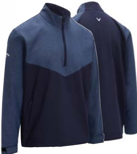
409 DARK MOODY HEATHER