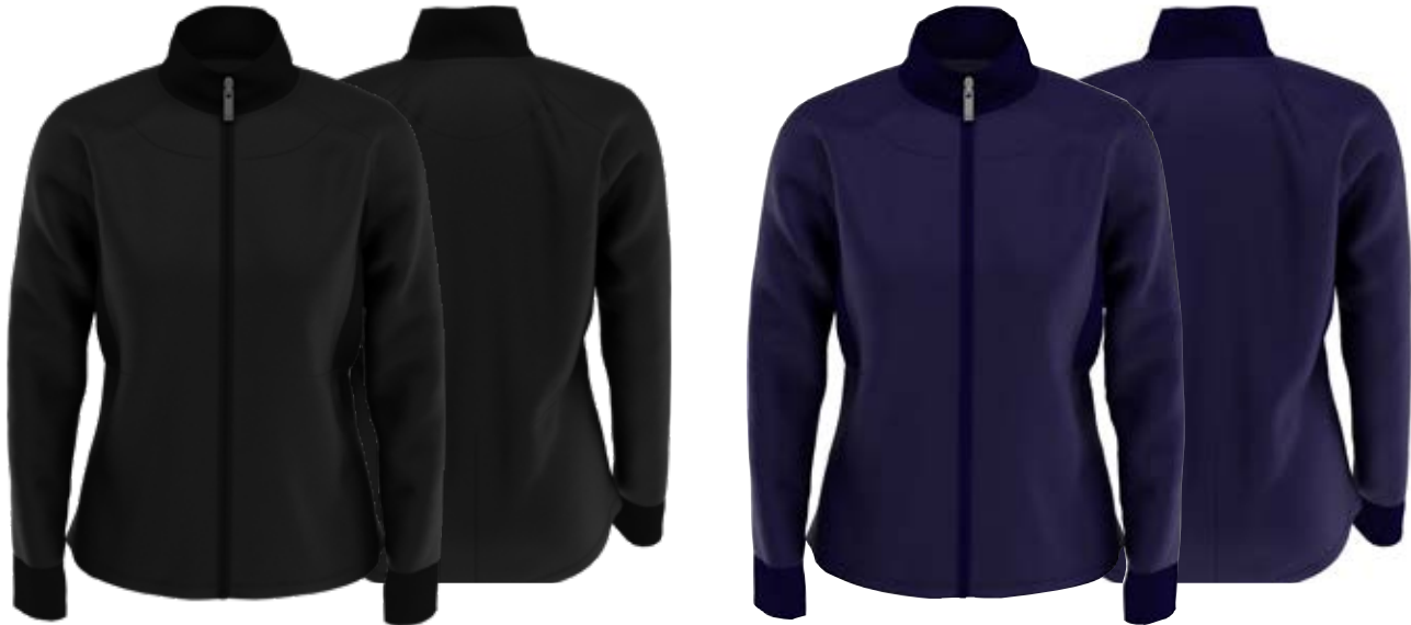
002 CAVIAR 410 PEACOAT