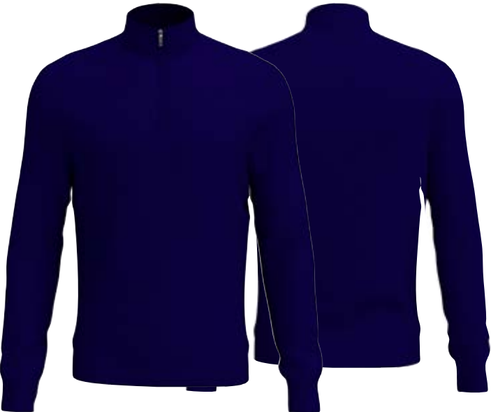
401 DARK NAVY