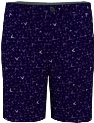
972 NAVY BLAZER