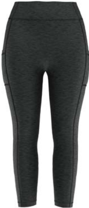
003 BLACK HEATHER