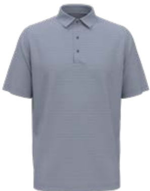
LIGHT INFINITY HEATHER NEW