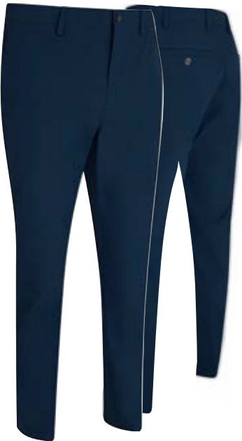
412 DRESS BLUE