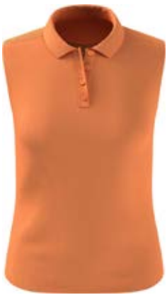
827 NECTARINE NEW