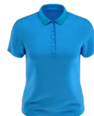
983 SPRING BREAK