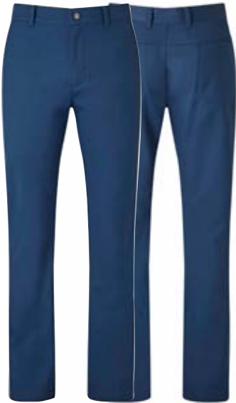
412 DRESS BLUE