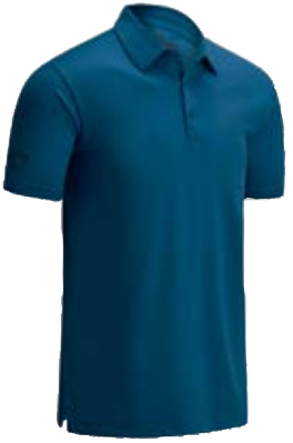
428 VALLARTA BLUE NEW