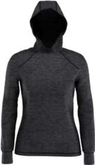
003 BLACK HEATHER