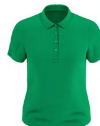
324 GOLF GREEN