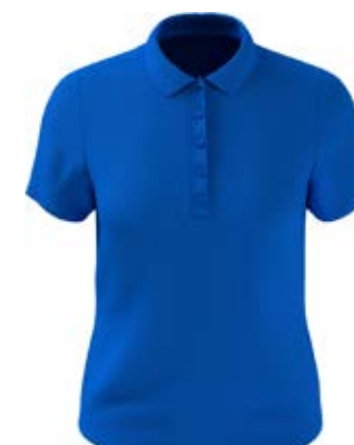
476 BLUE SEA STAR NEW