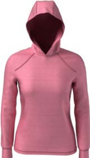
650 TRUE DOVE HEATHER