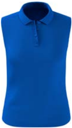
476 BLUE SEA STAR NEW