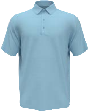
493 BLUE GROTTA HEATHER NEW