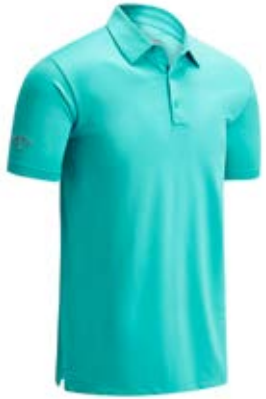
458 ARUBA BLUE NEW