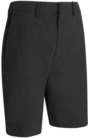
002 CAVIAR NEW