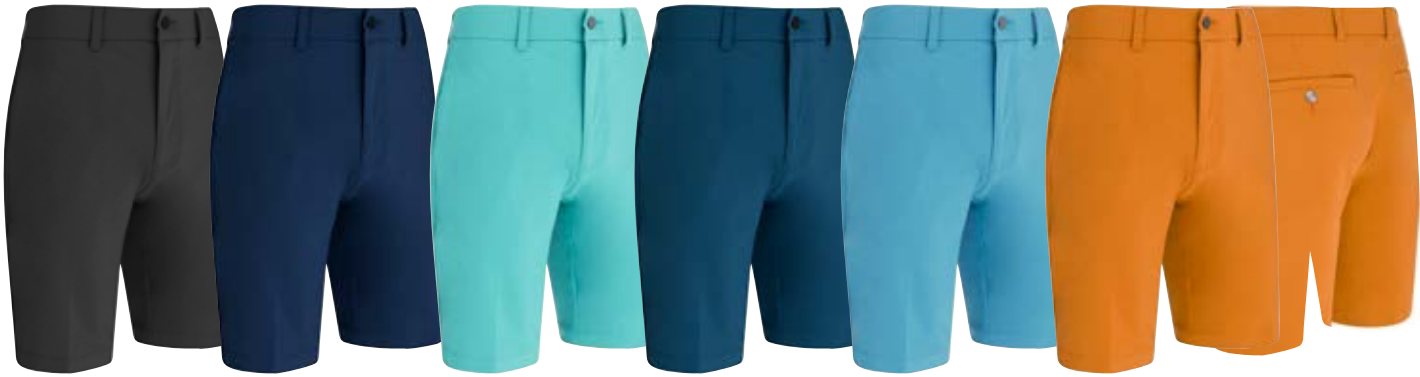
002 CAVIAR 401 NIGHT SKY 458 ARUBA BLUE NEW 428 VALLARTA BLUE NEW 488 BLUE GROTTTO NEW 820 BIRDS OF PARADISE NEW