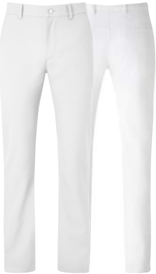
100 BRIGHT WHITE