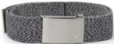
003 BLACK HEATHER