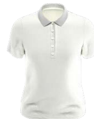
123 BRILLIANT WHITE