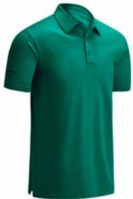
324 GOLF GREEN