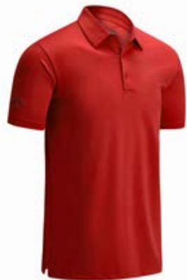
609 TRUE RED