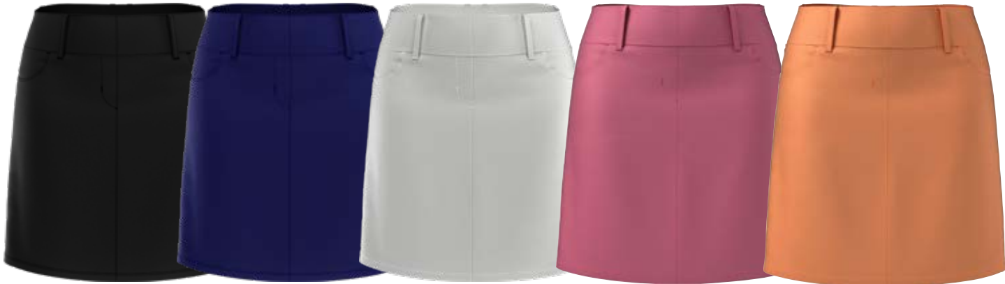
002 CAVIAR 412 DRESS BLUE 123 BRILLIANT WHITE 683 FRUIT DOVE NEW 827 NECTARINE NEW