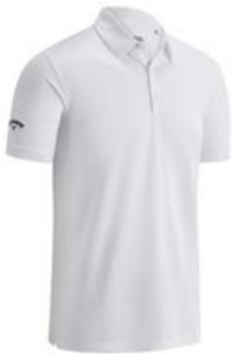
100 BRIGHT WHITE