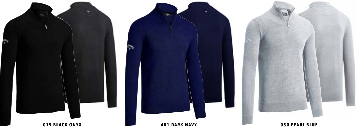
CGGS80Z3 1/4 ZIPPED MERINO SWEATER