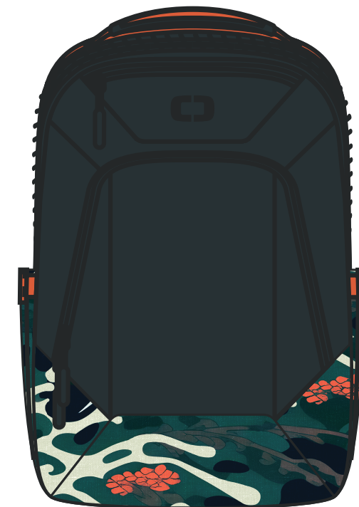
WAVE CAMO (5/15)