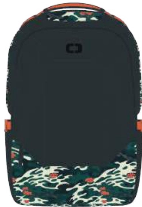
WAVE CAMO (5/15)