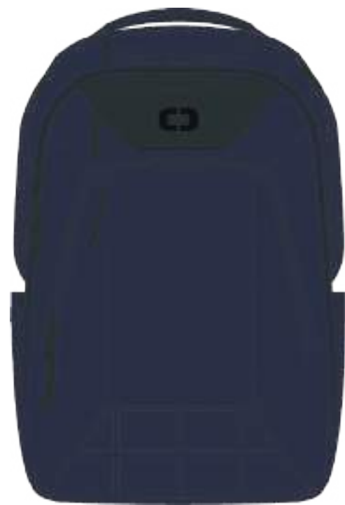
DRESS BLUES (5/15)