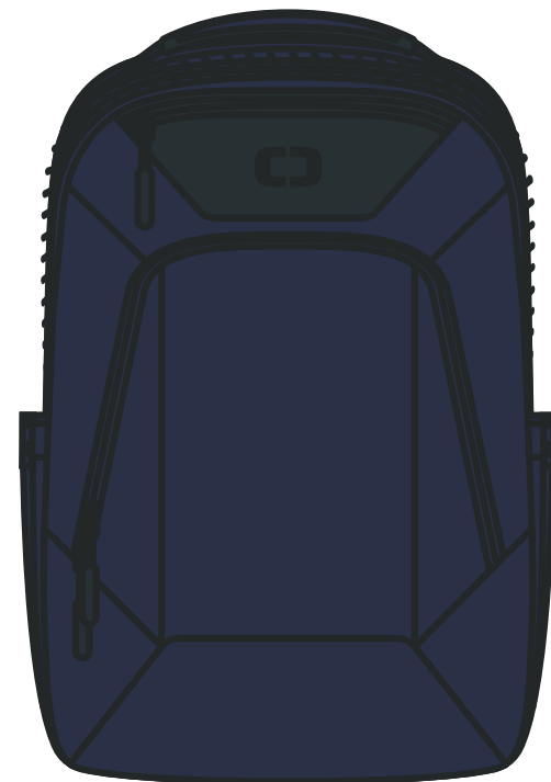
DRESS BLUES (5/15)