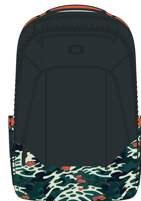
WAVE CAMO (5/15)