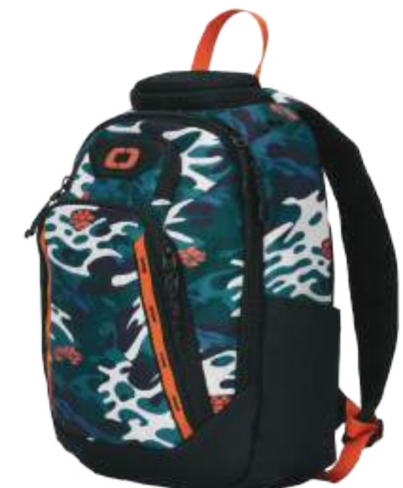
WAVE CAMO (5/15)