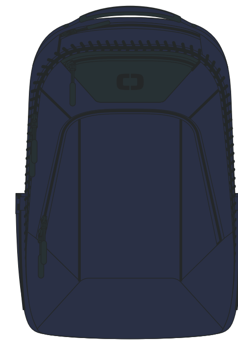
DRESS BLUES (5/15)